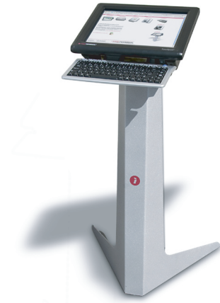
Optional: Foot stand, Keyboard